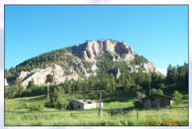
View from center of Zortman town site