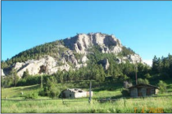
View from center of Zortman town site