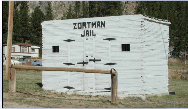
Historic Zortman Jail, located on Main Street